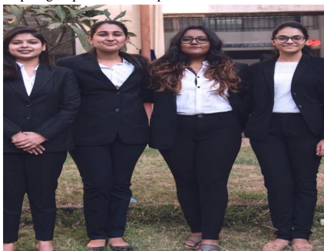
UNDER-GRADUATE PROGRAM [B. A. LL. B. (HONS.)]

MindCrest, Nishith Desai Associates, P&A Law Offices, Pangea 3, Price Waterhouse Coopers, Quizlex, SDD Global, Talwar Thakore and Associates, Wadia Ghandy & Co. and Zeus Law Associates etc. The students of HNLU have also been placed in Government Organizations, NGOs, Public and Private Sector Banks, International Organizations, Academic Institutions, etc. Setting high standards in their respective fields, they have become role models for younger generation of students as piring to pursue lawas a profession.