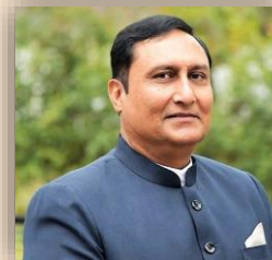
Shri Sanjay Alung Divisional Commissioner Bilaspur, C.G.