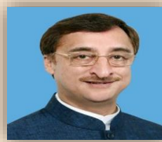
Shri. Vivek Krishna Tankha Member of Parliament, Rajya Sabha Senior Advocate, Supreme Court of India