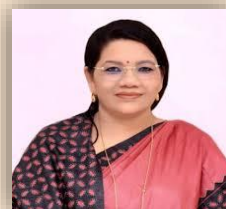
Guest of Honour Smt. Renuka Singh Saruta Minister of State, Ministry of Tribal Affairs, Government of India