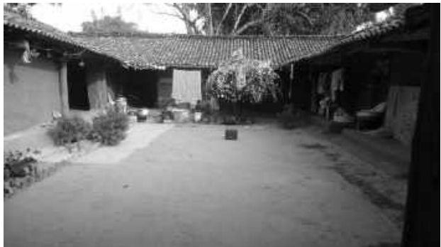
House of Oraon tribe covered with 'khapra' (mud tiles).

Approximately 500 – 600 years ago, the Oraons had a well-organized social, political, economic, and cultural life. However, conflicts, particularly wars with the Mughals, forced them to migrate further. The tribe split into two groups: one settled along the banks of the Ganges, while the other moved to the Son River’s banks in the northwestern part of the Chotanagpur Plateau. Today, the Oraon tribal communities are found in Chhattisgarh, Odisha, West Bengal, Assam, and Maharashtra 2 . Their native language, ‘Kurukh’ is considered to be a branch of the Dravidian language family.