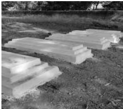
This is a picture of the grave (kabar) of the Oraon tribe.

During the final rites, the deceased is given a last sip of water before passing. The body is placed on a Kinda Pitri (palm leaf mat) with the head facing south. The family gathers, and the body is covered with a Kafan (shroud). Burial follows traditional customs, with essential personal belongings placed in the grave. A