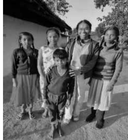
Children of Khunsi village, Dist. Surajpur

The second phase of their lives relate to marriage. Marriage within the Agaria Tribe traditionally occurred within the community but has become less restrictive in modern times. The proposal of marriage is initiated by the bridegroom's side. The marriage ceremony is generally conducted in a manner similar to that of other tribal communities in the area. While they have their own traditional practices and beliefs, these are not followed as strictly as those of other tribal groups. The head of the community and other members sit together and take collective decisions to conduct the marriage ceremony in accordance with their customs. After marriage, the wife's name is customarily linked to her husband's name.