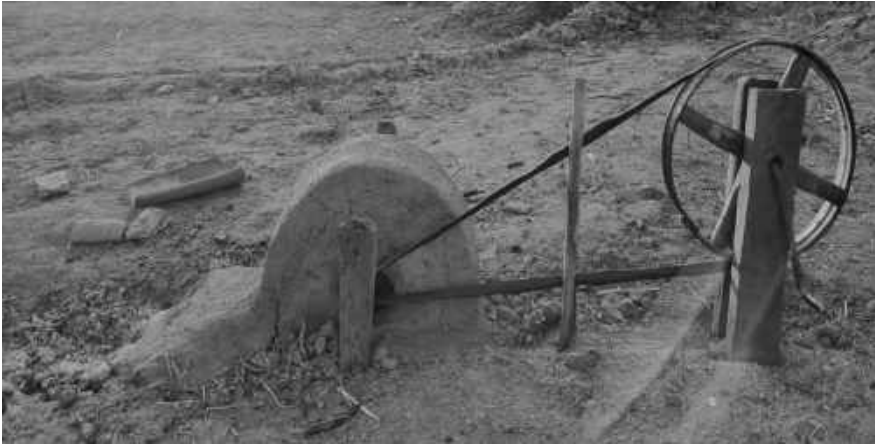
A furnace for iron smelting made of mud and wood.

The Agaria tribe is regarded as an offshoot of the Gond tribe, with a history that intertwines their cultural and occupational practices. 3 Initially, it was a sub-caste of the Gond tribe and later it was considered a separate tribal group. The people belonging to this tribe are called Asur or Asur Agaria in Surguja region, Khantia Chok or Mahali Asur or Mahali Asur Agaria in Bilaspur region, Gondook Agaria in Raipur region and Kelha Agaria in some other areas. They also refer to themselves as Lohar and belong to the Dravidian language family. Their status as a separate caste can be attributed to their specific occupation of smelting iron. Like the Gonds, they are divided into many exogamous totemic clans.