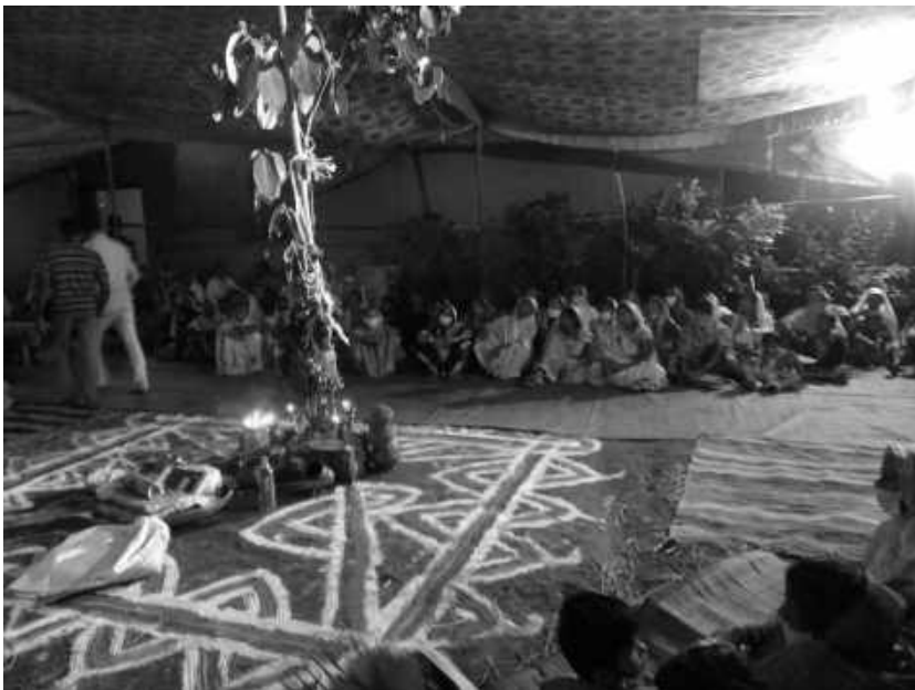
Mandopargani, mahua plant collected from local area/forest for making the mandap.