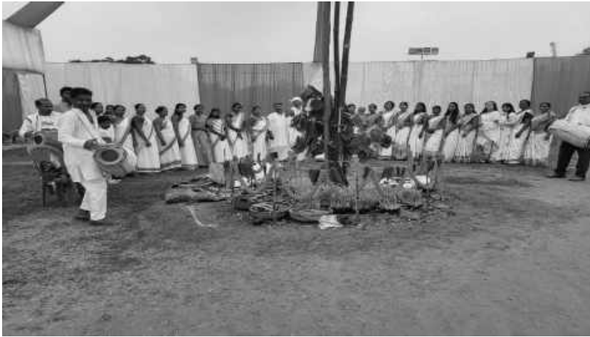
Kawar tribe celebrating Karam Festival

strengthening community bonds, celebrating nature's bounty, and honoring the cultural heritage of the Kawar tribe.