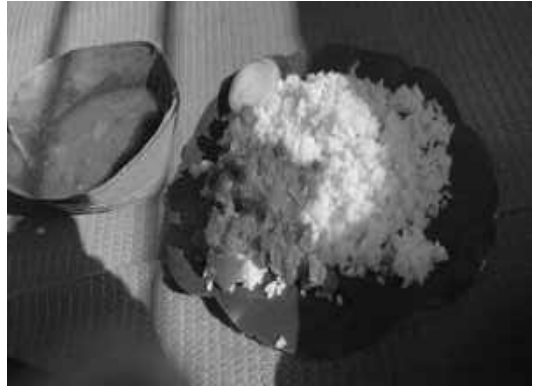
Plate made of Dona leaves used to have food by Koya Tribe

One of the Koyas' primary sources of livelihood is the collection of roots, fruits, leaves, tubers, herbs, and other forest produce. They harvest Tumid (Kendu fruit) in large quantities when ripe, sun-dry it, and store it for use during periods of food scarcity. Mahul trees grow abundantly in the Koya region, and during March and April, vast amounts of Mahul flower are gathered, dried, and preserved for later consumption. From July to September, various types of roots are foraged from the forest and used as food. Another significant food source for the Koyas is roots gathered from the jungle, which serve as both staple food and traditional medicine. They also consume young green bamboo shoots. Women collect a variety of wild greens from fields, forests, and water's edge, referred to as Kusir , which are typically cooked and eaten with rice. Seasonal wild fruits, such as Marka (mango), Edka (Kusum), and Nendu (jamu), are gathered and consumed fresh but are not preserved. Tamarind trees are commonly found in the region 9 , and households with these tree store extra tamarind, which is then shared and enjoyed together in the community.