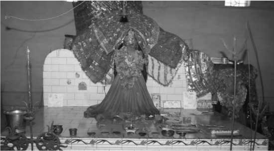
Temple of Manka Dai (wish goddess)

Various energies that reside in natural elements are worshipped, such as Dulha-Pen (bride-groom deity) is invoked and invited during marriage, Hardul Pen (God of Cholera), Marai Mata (life protector), Kankalin Dai (evil protector) Matiya-Pen (child deity) etc.