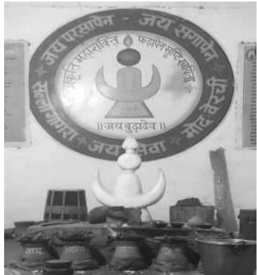
Temple of Budhadev in the village of Bargawan, district Janjgir Champa

Certain duties that Gonds must perform as dictated in Koya-Punem : respect maternal and paternal energies, honour dharma gurus, fulfil one's duties towards wife and children, maintain good relationship with friends and companions, serve the Saga Samaj , service to Persapen should be the first service and live life according to principles of Koya Punem . Gonds celebrate various festivals, and some of the prominent ones are Dusshera, Diwali, Holi, Pola (honours cattle), Naukhai (Harvest festival), Saga Pen Pooja , Naag Panchami, and Navratri.