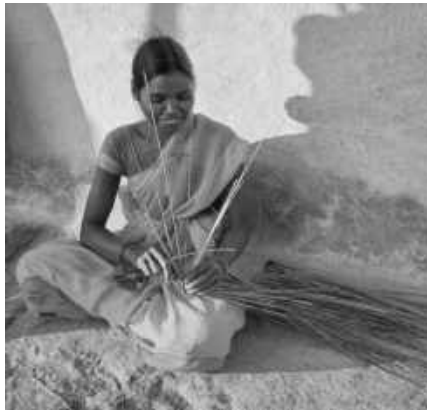
Binding dried grass together to craft a traditional broom

Agriculture has become the major source of income for the livelihood of the Agaria tribes. Though most of them are marginal farmers depended on rainfed agriculture, they manage to grow sufficient crops for their survival. The major crops cultivated are paddy, oil seed, gram, groundnuts, and other seasonal vegetables. They also depend on non-timber forest and livestock for additional support. Earlier, the Agaria community was mostly engaged in providing services to the community. In return, they received support in the form of grains while also earning a small income by selling their handmade agricultural equipment. However, over time, they acquired land and gradually shifted to cultivation as a means of livelihood.