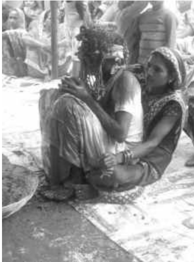
Haldi ceremony where the groom sits on a relative's lap.

system in which certain gifts or essential items, regarded as wedding presents, are given to the bride.