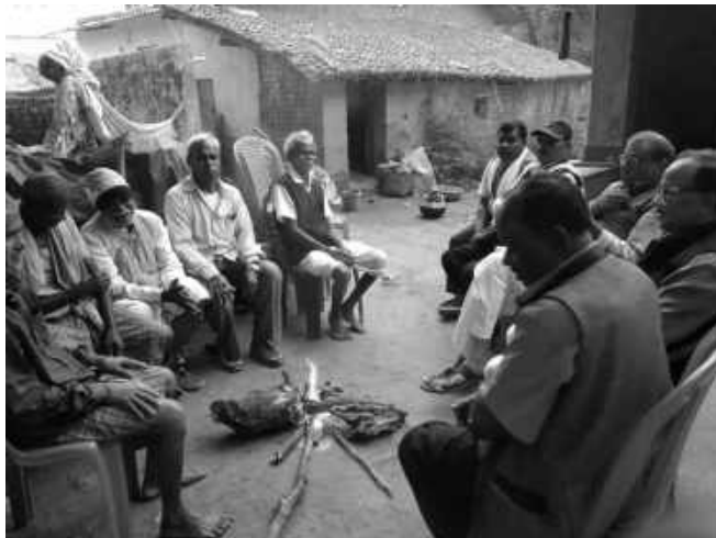
Local Gathering of the Halba Tribe

The Halba tribe combines traditional leadership systems with contemporary structures which showcase their past heritage together with modern