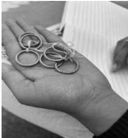
Tappar: A traditional ring-like ornament used by the Koya tribe in ceremonial practices such as birth and death rituals

house following a ritual offering of Mand Salfi (local alcohol) and chicken are offered to the Wadde (spiritual leader).