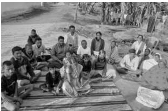
A group of villagers gathered together – Khunsi Village, Pratappur Block.