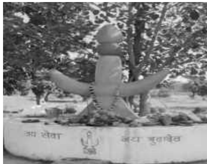
The Stambh of Persapen or Badadev. It is shaped like a trident, the blue globe represents the earth, and above it, the orange globe symbolises the sun. The number ७५०, written in Hindi, signifies the 750 gotras of the Gonds.

The Gond leader, Pahandi Pari Kupar Lingo , established the code of conduct, “ Gondi Punem ” which dictates the lifestyles, norms, values and religious beliefs that a Gond must follow. The teachings of Gondi Punem have been passed down orally through generations. The Koitur religion is called “ Koya-punem .” The philosophy of Koya-punem is that nature was created from nothing and gave human beings the power of the brain to navigate life on the earth in harmony with nature. In Gond cosmology, all-natural elements, both animate and inanimate, exhibit energy that is eternal and never dies. The energies that exist in plants, animals, stones, rivers, mountains or celestial phenomena are therefore worshipped. Koya Penum states that when a person is alive, the energy exists in the form of “ Wen ”, and when they die, the energy transforms into “ Pen ”, i.e., an energy to get transformed into another energy. Pens are the energies of the ancestors. Maternal energies are called “ Budhida ”, and paternal energies are called “ Budhadev .” This is why Gonds remain connected with their ancestors and seek their presence to overcome hardships and illness and ensure crop prosperity. The supreme deity of the Gond tribe is Persapen or Badadev – it is the energy that operates the earth and its elements like air, water, sky, land, fire, and geological phenomena.