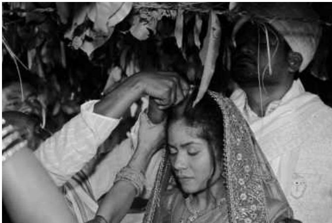
During Sindoor Tikawan, a long piece of cloth is used to cover the 'madwa' to forbid non-family members from viewing the vermilion.

At last, they give Bida (farewell) to them by folk dancing and singing songs. These were the Pre-marriage ceremonies. When the relationship is finalized, the groom's side gives 7 rupees (the bride's price) to the five representatives of the bride's side, which is then given to the bride's family after the marriage.