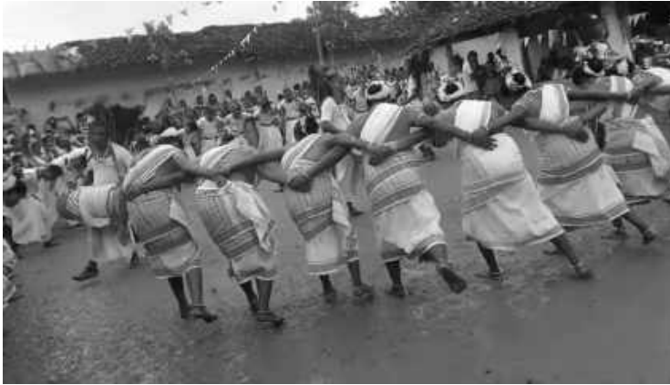
Oraon tribe celebrating 'Karam' in the 'Akhara' (a place where the Oraon tribe dances). Women are in traditional 'motha' saree dance in sync with the beats of the 'mandar' ( traditional drum' ) played by the men of the tribe.

This festival is dedicated to 'Karam-Devta', The deity associated with power, youth, and vitality, and is celebrated to ensure a bountiful harvest. During the event, nine types of seeds, including rice, wheat, and corn, are planted in a basket known as 'Jawa'. Young girls tend to these seeds for 7 to 9 days while fasting throughout the day.