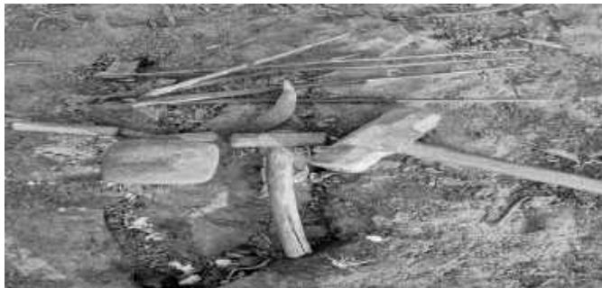
Equipements used for crafting tools.

The Patharia Agaria 5 are traditionally associated with extracting and smelting iron ore from the rocky terrains, explaining their name which is derived from “pathar,” meaning stone. They are skilled in the art of mining and converting raw iron ore into usable iron through indigenous smelting techniques. Their expertise lies in crafting essential agricultural and household tools such as ploughshares, axes, sickles, which are vital for the rural communities they serve. Those Agarias who