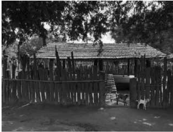
Ghotul : place where all the decision for welfare of village is taken.

It functions as a political and cultural institution where roles are bifurcated among Gaitha , Manjhi and Patel . The head is Gaitha and is responsible for the decision-making on critical matters. Manjhi is responsible for the spiritual and religious rites during festivals, and for carrying pen purka from village to village for kaksar . Patel functions as a mentor for the boys and girls in Ghotul . He directs the social functions like marriage, funerals, and other events in the village to ensure their smooth execution. Villagers who face any kind of problem can approach Ghotul such as property disputes, theft, murder, land allocation, marriage etc. If a meeting is to occur in the village, a drum is beaten to inform everyone about the same. An investigation is conducted and the head delivers the decision and imposes a penalty of a certain amount. In case of property dispute, the parties are made to submit 100 Rs each in Ghotul . This amount is either used for the welfare of the community or as expenses in festivals or saved for calamity. The decision taken in Ghotul is absolute with non-compliance leading to penalty or exclusion from the community.