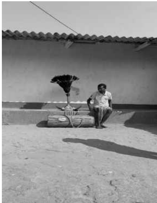
Traditional musical instrument dhol with kokatta

Although the Koya people engage in various handicrafts, they specialize in making Kokatta and Dhol, traditional musical instrument unique to their community. These instruments hold both cultural and religious significance.