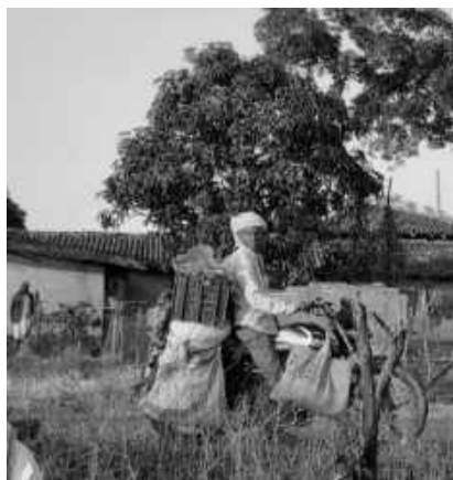
A member of the Agaria tribe heading to the market to sell his produce