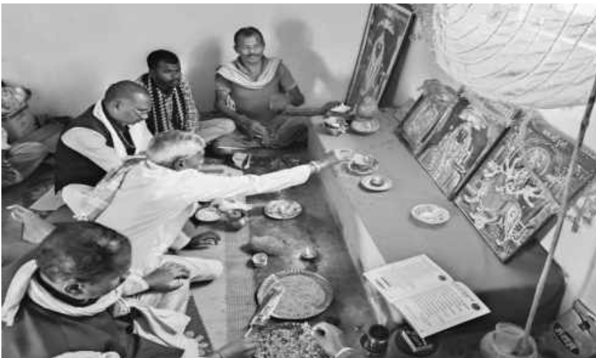
Shakti pooja where elders pray and chant to the goddess danteswari(which is at the centre) consider has major deity to the halbas.