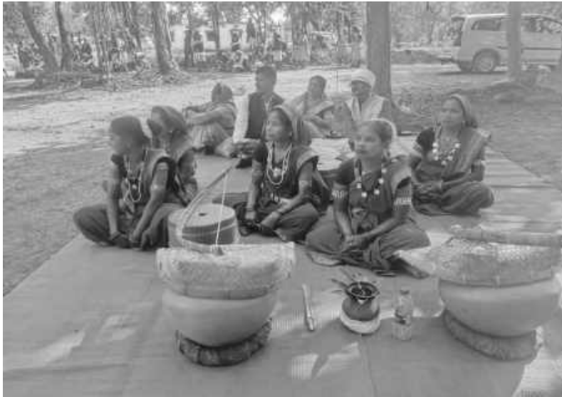
'Dankul', a traditional singing band in Halba tribe